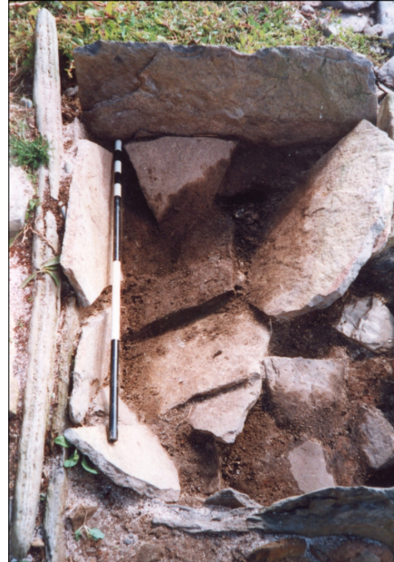
Plate 2: The collapsed capping slab of the cist.

heathland material. It was a silty-sand deposit with fragments of stone which were thought likely to be representative of the collapsed capstone (Plate 2). The largest piece of stone was noted by the excavators to have damaged the skull and one arm of the skeleton (Plate 3).