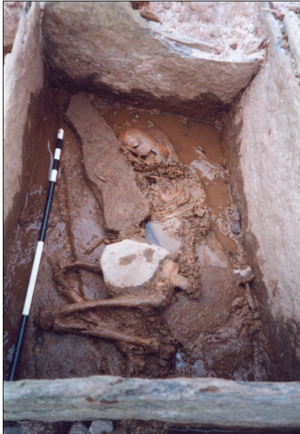
Plate 4: The inhumation fully excavated.