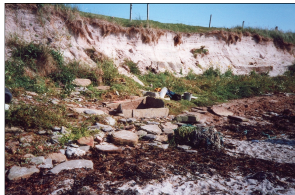
Plate 1: The cist prior to excavation.