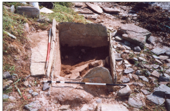
Plate 3: The partly excavated lower fill of the cist with the fragment of capstone that crushed the skull and arm bones of the inhumation (not exposed).

The majority of lithic artefacts recovered during the excavation came from (009) and proved to be predominantly fine knapping debris (see below). Amongst this material one core, one blade, approximately 20 flakes and an end scraper were noted. Six sherds of pottery were also recovered including a decorated rim fragment of three conjoining sherds from a bucket-style vessel with a flat rim. A separate vessel within the main cist fill is represented by the presence of Sherd 8, also decorated but with a slightly different design. Two further sherds from (009 and 001) may represent separate vessels.